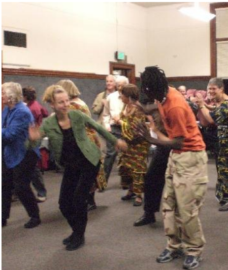
Above: Delegates and Axim residents join together for a dance.