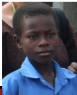
Below: Students at the Manye Academy