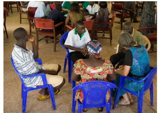
Delegates from Ghana and the US participate in a Town Hall discussion

In the fall of 2006, GCJ partnered with the Western Heritage Home to bring its second group of delegates (15 US and 13 Ghanaian) to the town of Axim, Ghana to build an orphanage and community center. Delegates were able to share technical skills and professional expertise, along with participating in workshops promoting cross-cultural understanding, compassionate listening, conflict resolution, gender dialogue, leadership skills and HIV/AIDS understanding. The delegates hosted a powerful Town Hall dialogue with a cross section of over 150 Axim citizens, from fish mongers to judges, youth, women, elders, Christians, Muslims, professionals and illiterates.